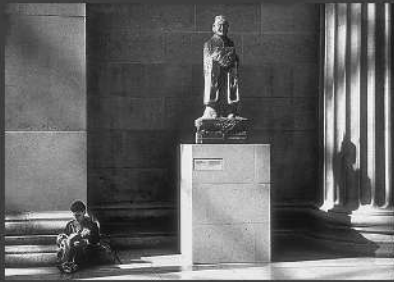
CERTIFICATE - Master & Pupil

The following pictures are some of the golds Don has submitted for our annual over past years.