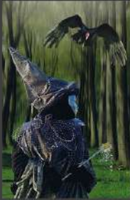
Come My Pretty One