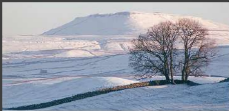
Evening Light, Wensledale