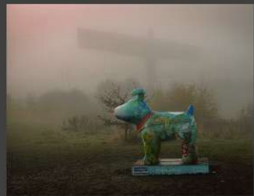
Guarding the Angel