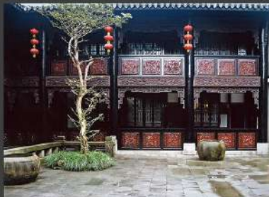
Inside Old Palace