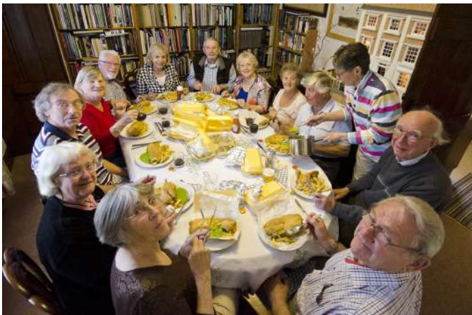
Fish and chip supper