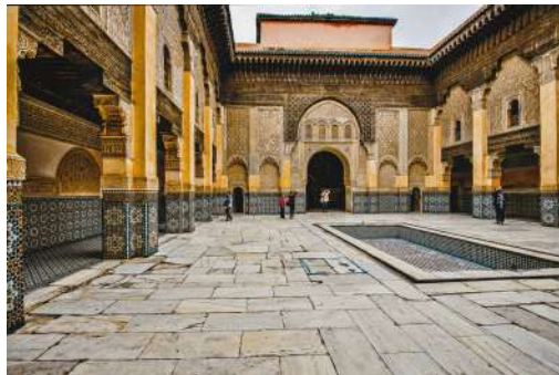
Medersa of Ben Youssef by Walter Steiner. Awarded Circle Certificate 2017 Exhibition—C3.14