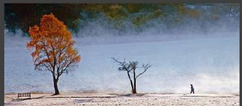
Walk in the Mist