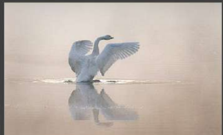
In a Flap