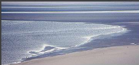
Morecambe Bay From Grange