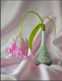
CERTIFICATE Decaying Tulip CERT

Below are some of Vince's golds submitted over past years.