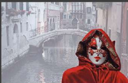
Lady in Red