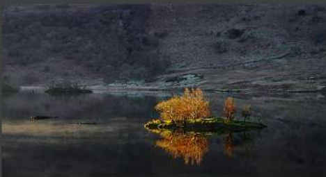
CERTIFICATE - Morning Light