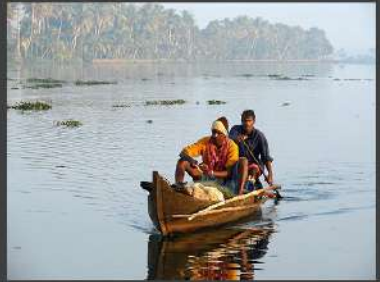
Fishing in Kerala's Backwater