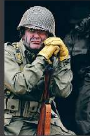
The Battle's Over